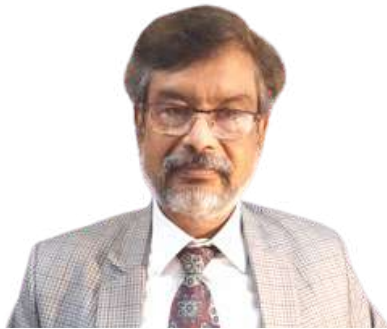
GENERAL SECRETARY & CEO SPEAKS