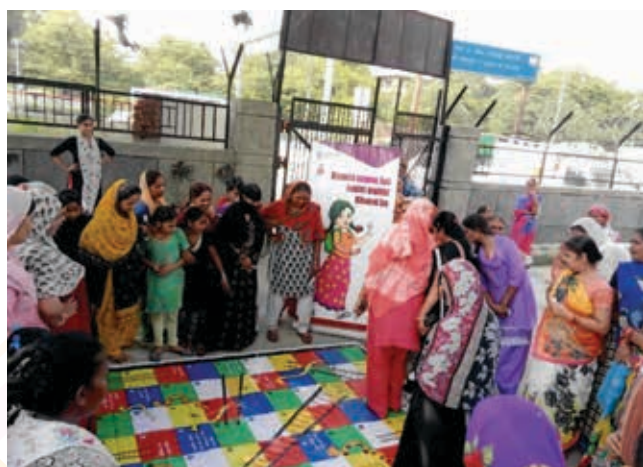
AGP on Symptoms & Prevention of Leprosy 14 th August, 2018