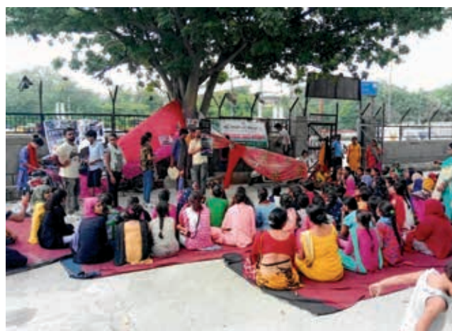
AGP on "Humari Awaz- Humari Kahani" 28 th August, 2018