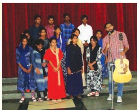
Prayer Breakfast Fellowship – 9 th June, 2018