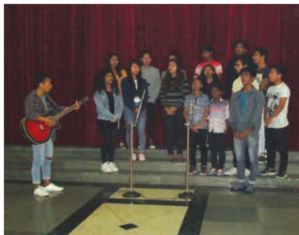
Prayer Breakfast Fellowship – 8 th September, 2018