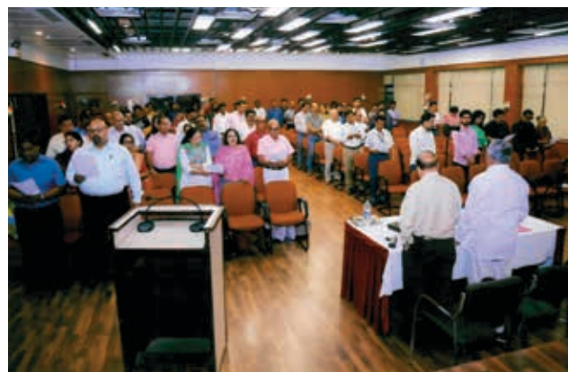
Prayer Breakfast Fellowship – 11 th August, 2018