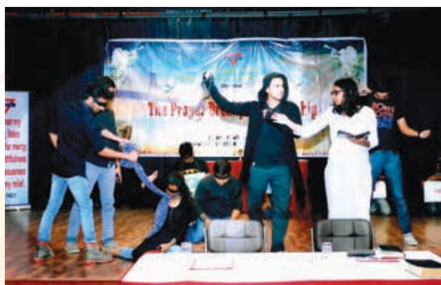
Prayer Breakfast Fellowship – 8 th September, 2018