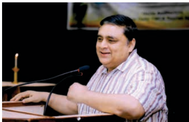
Prayer Breakfast Fellowship – 12 th May, 2018