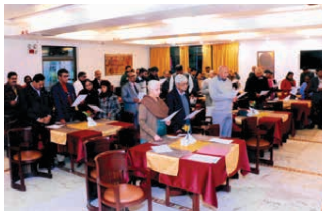
Prayer Breakfast Fellowship – 9 th February, 2019