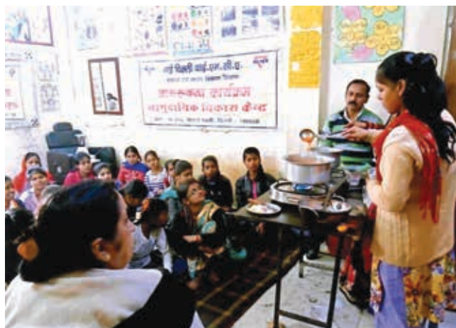
AGP on Food and Nutrition – 4 th to 8 th February, 2019