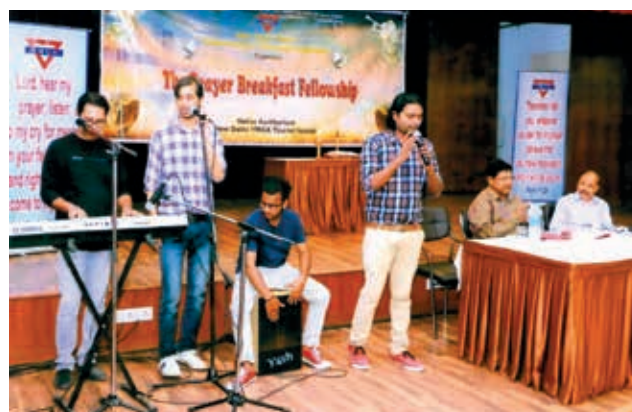
Prayer Breakfast Fellowship – 13 th October, 2018