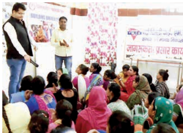
AGP on women Empowerment through Leadership – 30 th March, 2019