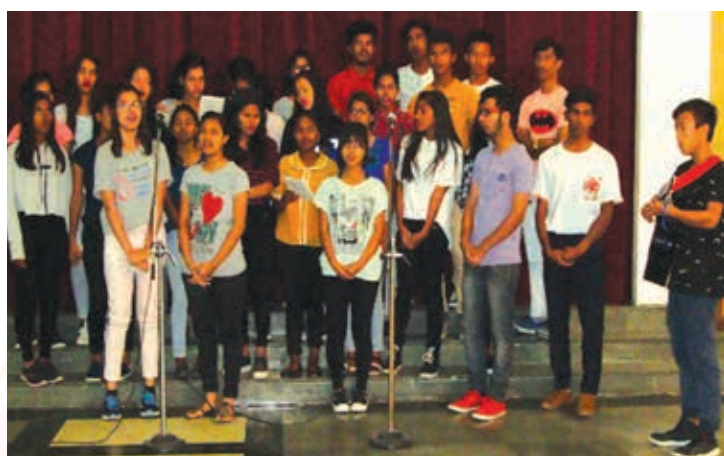
Prayer Breakfast Fellowship – 14 th April, 2018