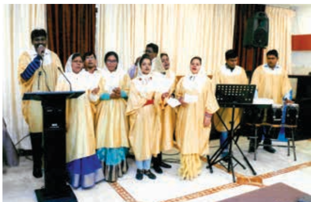
Prayer Breakfast Fellowship – 12 th January, 2019