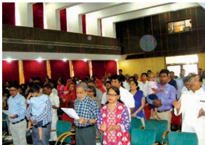
Prayer Breakfast Fellowship – 14 th July, 2018