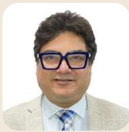
FROM THE DESK OF THE GENERAL SECRETARY & CEO