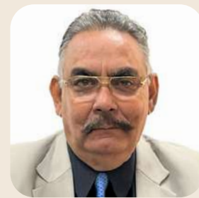
FROM THE OFFICE OF THE PRESIDENT

"Be strong and courageous. Do not be afraid; do not be discouraged, for the Lord your God will be with you wherever you go." – Joshua 01:09