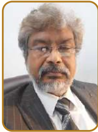
GENERAL SECRETARY & CEO SPEAKS