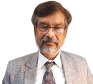
GENERAL SECRETARY & CEO SPEAKS

BUILDING COMMUNITIES | 15 JANUARY 2022 | VOLUME 31