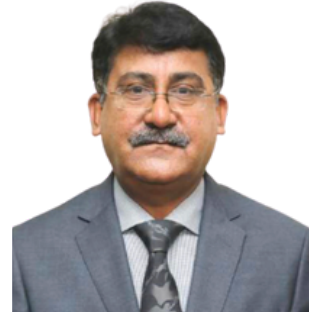
FROM THE OFFICE OF THE PRESIDENT