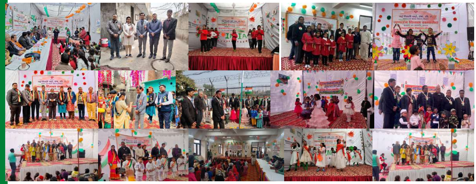
Republic Day Programme (23rd, 24th & 25th January 2023)

The New Delhi YMCA, Department of Social and Human Development celebrated