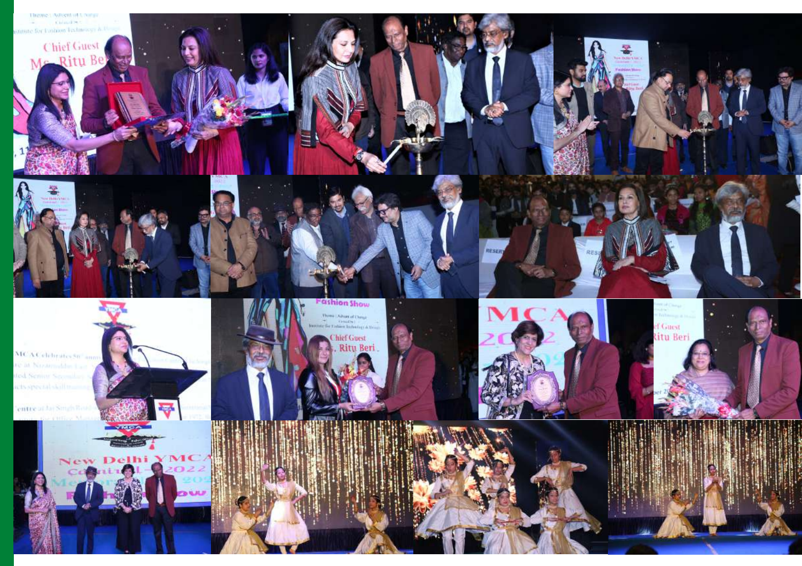
THE RAMP SHOW