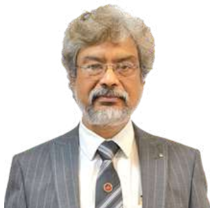
GENERAL SECRETARY & CEO SPEAKS

BUILDING COMMUNITIES | 15 MARCH 2022 | VOLUME 35