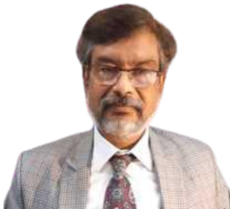
GENERAL SECRETARY & CEO SPEAKS

BUILDING COMMUNITIES | 01 FEBRUARY 2022 | VOLUME 32